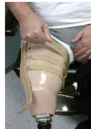
Adjusting CJ Socket for limb volume change.

The essential engineering difference in this innovation is a non-elastic but comfortable panel called a "sail" (due to the material's similarity to that used in a Dacron boating sail), which comprises roughly half of the socket circumference, combined with a patient-adjustable Velcro closure. Rounding out the design is a rigid "J" shaped frame, which covers the remaining half of the residual limb, transfers weight-bearing forces from the prosthesis to the residual limb, and provides skeletal control.