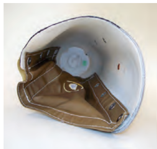
Proximal view shows details of CJ Socket construction.

As the residual limb loses volume during the day, the socket becomes unstable with resulting increased motion between limb and socket. Hydrostatic lift and weight-bearing efficiency are reduced,