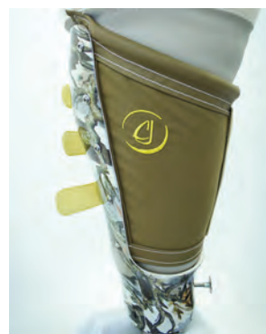
CJ Socket with unique "sail" feature.

We gratefully acknowledge the assistance of CJ Socket Technologies and Otto Bock Health Care in compiling this issue.