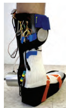
Portable powered AFO; see page 2.

We hope you find the coverage interesting and worthwhile.