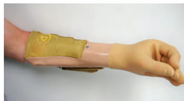
Transradial CJ Socket

Enter a radical new design, the CJ Socket, which gives the wearer the ability to loosen or tighten socket fit as required for residual limb volume change in seconds.