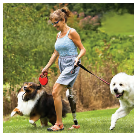
Amputees capable of walking with a variable cadence rate a K-3 or K-4 assessment.

As before the CMS change in policy, we are fully prepared to evaluate any patient's functional capability and recommend a prosthetic course of treatment to any of our referring physicians.