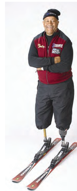
Athletes and active amputees should be classified K-4.

We look forward to continue working with physicians and patients alike to achieve the best possible prosthetic results for both new and "experienced" amputees.