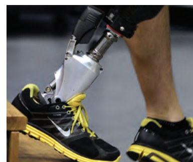
iWalk BiOM prosthesis

In place of the passive spring core of the typical contemporary prosthetic foot, the battery-powered BiOM incorporates microprocessors, gyroscopes and motors to sense the wearer's ambulatory purpose and respond with the appropriate positioning and force, effectively replacing the function of the absent calf muscle and Achilles tendon.