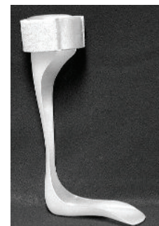
Posterior leaf spring AFO.

Posterior leaf spring AFO —In general, our approach with any orthosis is to provide the lightest and least-complex device that will get the job done. In the early stages of MS and ALS, that objective is generally best delivered by a custom-molded posterior leaf spring AFO, a simple L-shaped brace that provides necessary support primarily behind the ankle and under the foot and adds a degree of dorsiflexion assist. Width and thickness are customized to reflect the strength and weight of the patient. With its thin profile and light weight, this AFO enjoys a high level of patient acceptance.