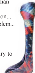
Laminated Solid-ankle AFO

In the certified orthotist, rehabilitation decision-makers have at their disposal an AFO expert who can help them achieve optimal outcomes for their patients. Call us for details.