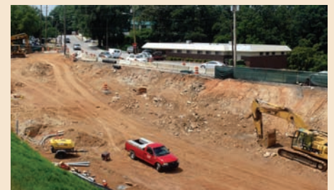
Above: July 2010; below, July 2011

Thank you for bearing with us throughout this major improvement.