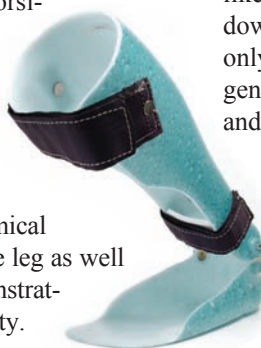
Articulated AFO

Articulated AFO —This design, featuring medial and lateral hinge joints closely aligned with the anatomical ankle joint and trimlines encompassing the sides of the leg as well as the back, provides added support for patients demonstrating drop foot along with medial and/or lateral instability. The articulated AFO can also help control knee hyperextension resulting from quadriceps weakness.