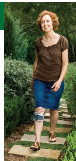
FES unit for drop foot