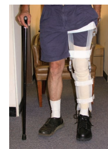
Knee-ankle-foot orthosis Courtesy Ultraflex