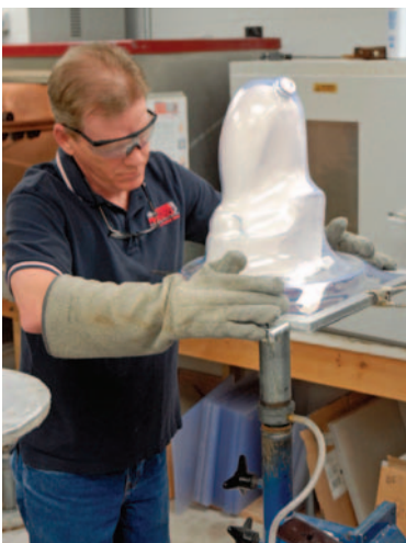
Forming the check socket.