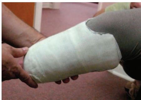
Fiberglass cast creates image of residual limb for fabricating prosthetic socket.

The preparatory prosthesis also helps the clinical team determine the amputee's ultimate ambulation potential and the most appropriate components for the permanent system.