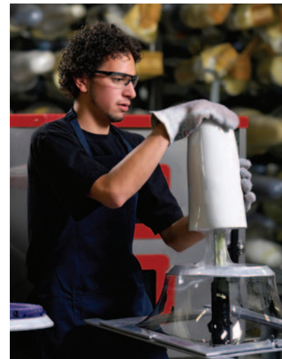
Vacuum forming a socket over mold of a residual limb.

Selecting the most appropriate componentry for a new amputee's specific needs and abilities is an essential part of the prosthetic process. After a careful preparatory phase, the definitive prosthesis is fabricated using more permanent materials and incorporating all knowledge gained to date.