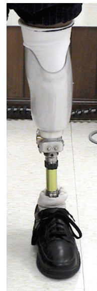
Check sockets enable prosthetists to view residual limb in "working" environment.

Patients normally wear their preparatory prosthesis for 3-6 months. During this period, prosthetist and therapist can interact to help the amputee adjust to his or her maturing residual limb and other physical changes. Several fit and alignment adjustments are normally made during this period as residual limb edema subsides and the patient's gait becomes more efficient.