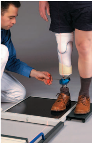
LASAR Posture alignment system.

“Fit” refers to the quality of the interface between the socket and residual limb. “Alignment” is the important relationship of the socket, ankle and foot in a below-knee prosthesis (adding the knee for an above-knee limb). Because a unilateral lower-limb amputee expends an estimated 40 percent more energy walking than a person without limb loss, it is essential that the limb function with optimal efficiency.