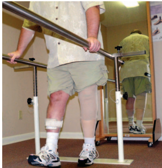
Gait training—Key ingredient for regaining ambulatory mobility.

Between these extremes the custom removable rigid dressing and prefabricated options such as the APOPPS (Adjustable Post-Operative Protective & Preparatory System) offer compromise solutions that enable both wound inspection and reasonably early weight-bearing. Even if not involved before the amputation, the prosthetist can still initiate early intervention if the referral is made while the patient is still in the hospital. The sooner the prosthetist and therapists working with the new amputee can coordinate their efforts, the better.