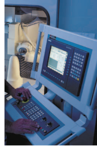
CAD/CAM carver brings digital precision to forming socket molds.