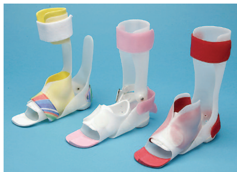
Combination (two-piece) AFOs