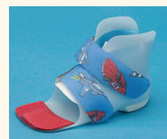
Supra malleolar orthosis (SMO)

This newsletter explores the contribution orthotics can make in the C.P. management milieu. We hope you find the information worthwhile and welcome your comments and inquiries.