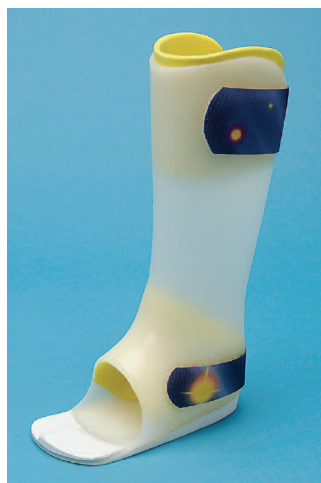
Floor reaction orthosis

Available research is inconclusive on the relative merits of different AFO options, so selection of a particular design is a combination