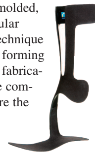
AFO Dynamic shows thin profile possible with pre-preg composites.

cured pre-impregnated composite pre-shaped into the general form of a particular AFO design can be custom-molded, trimmed and adjusted for the needs of a particular patient, sometimes in a single office visit. This technique could conceivably eliminate the casting, vacuum forming and extensive sanding commonly required in the fabrication of plastic orthoses. Pre-preg thermoformable composites may accept several fine adjustments before the material completely cures.