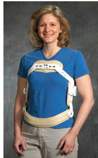
Jewitt spinal orthosis

Custom fit and custom design and fabrication are two different things. An off-the-shelf device can be modified and adjusted to achieve the best possible result, given that it was not constructed to a custom mold of the patient’s anatomy. Such alterations and accommodations require a degree of training...minimal for basic fabric corsets, soft collars and other soft goods,