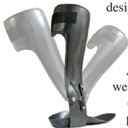
Pre-preg custom articulated AFO