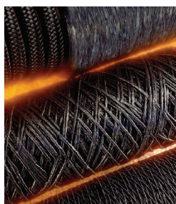
Pre-preg carbon fiber composite

Thermoplastics are durable and allow orthotists to build in required flexibility by varying thickness and geometry. However, they also present certain drawbacks, including a thick profile that can limit footwear choices, heat discomfort (thermoplastic is an insulator), and a sometimes lengthy fabrication process. With KAFOs the weight of the orthosis can be a deterrent to patient tolerance and effective ambulation, as well.