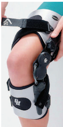
GII osteoarthritis knee brace

While we respect and value our relationship with all providers of clinical rehabilitation services, we also believe that a certified orthotist is the practitioner best prepared and experienced to select, design, fit and maintain orthotic devices, whether prefab or custom.