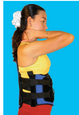
OrthoLux lumbo-sacral orthosis

To be sure, some types of “soft goods”—e.g. spinal corsets, soft cervical collars, elastic knee supports and wrist gauntlets—don’t