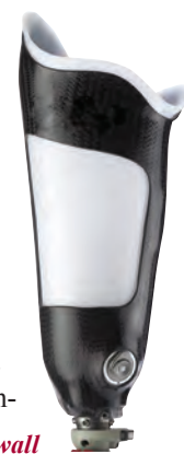
Double wall transfemoral socket

A hydrostatic weight-bearing socket is a specific version of the TSB design, cast in a compression environment to achieve uniform pressure distribution across residual limb tissues. This design encourages tissue elongation within the liner, increasing padding at the distal residual limb and reducing potential for skin breakdown.