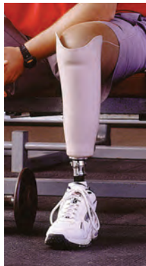
Transtibial PTB socket with locking pin suspension